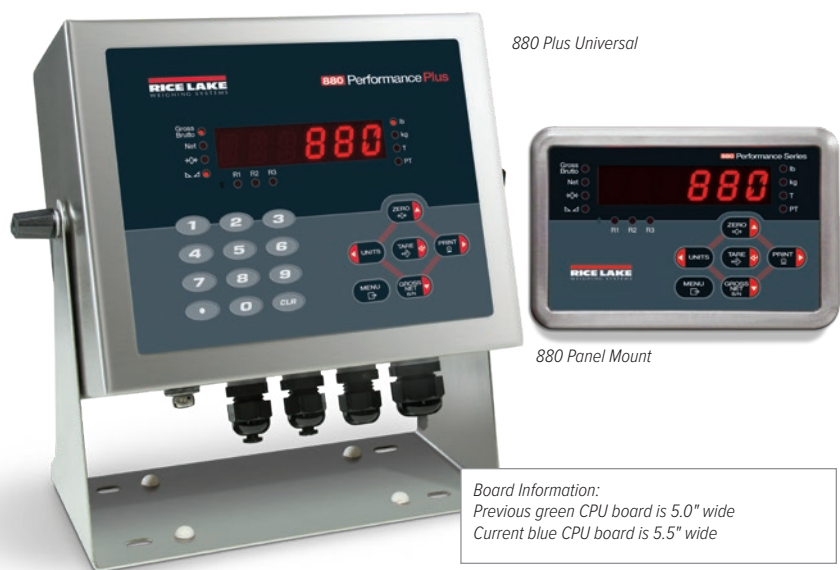
880 Plus Universal

Programmable Weight Indicator/Controller